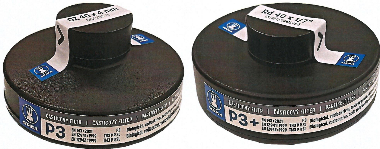
Filter P3 thread OZ40x4mm Standard