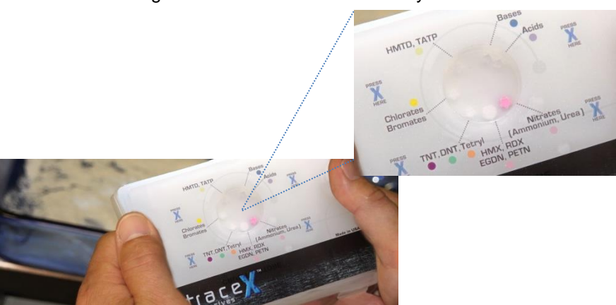
Figure 2. Close up view of TraceX showing Nitrates indication.

The Trace X<sup>®</sup> Explosives kit was designed to give an unambiguous color change to alert the user of the presence of any materials listed in Table 1 of this guide. The color change will occur in the indication pads located in the kit top. When the kit is operated, all pads will show a slight wetting effect, resulting in the pads changing from white to off-white or light gray; this wetting effect is normal and does not indicate the presence of an explosive. Below is an example of the color change after sampling Nitrates (Figure 2). Although it is not necessary for the user to know the specific color for a positive indication, the typical color for each class at trace levels is included on the kit label and shown in Table 2. The intensity and shade of color can change based on the amount of analyte detected.